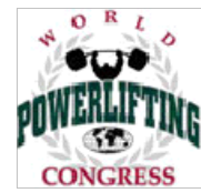
World Powerlifting Congress - Australia